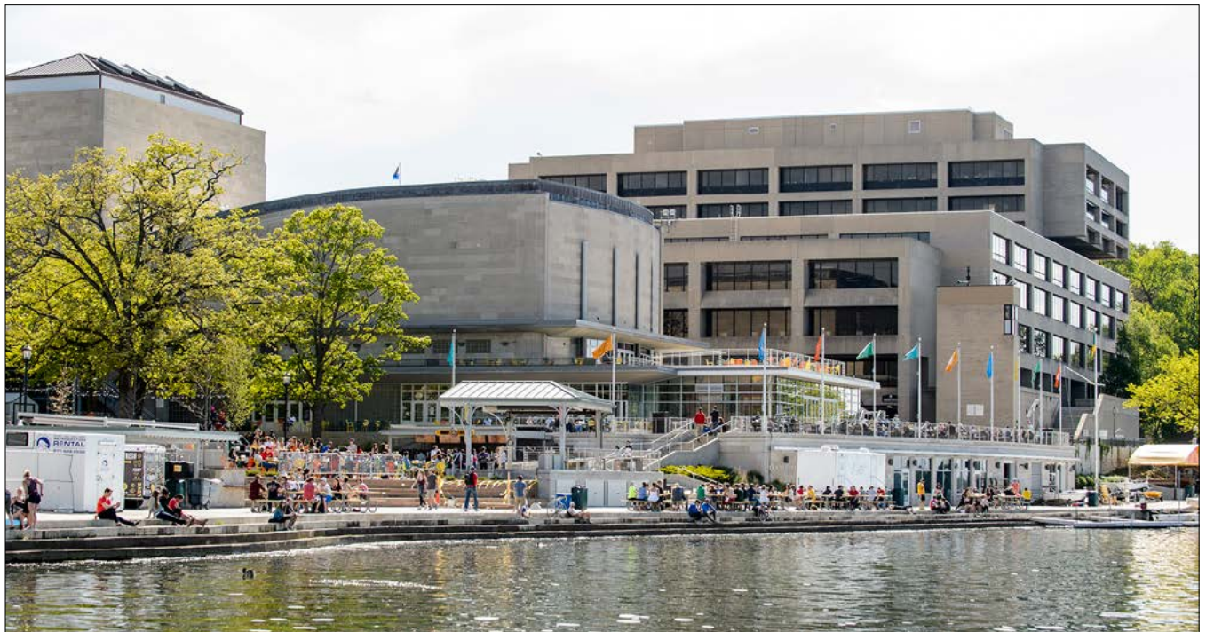
Memorial Union Terrace