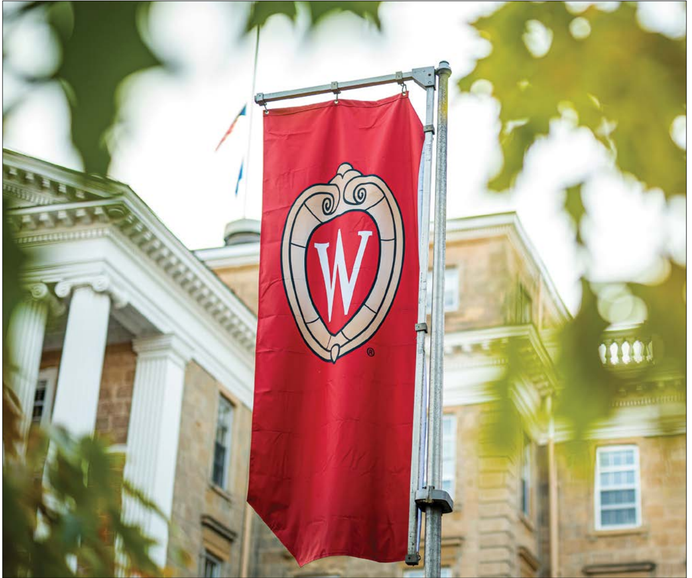
The university crest banner on Bascom Hill is pictured among the leaves.