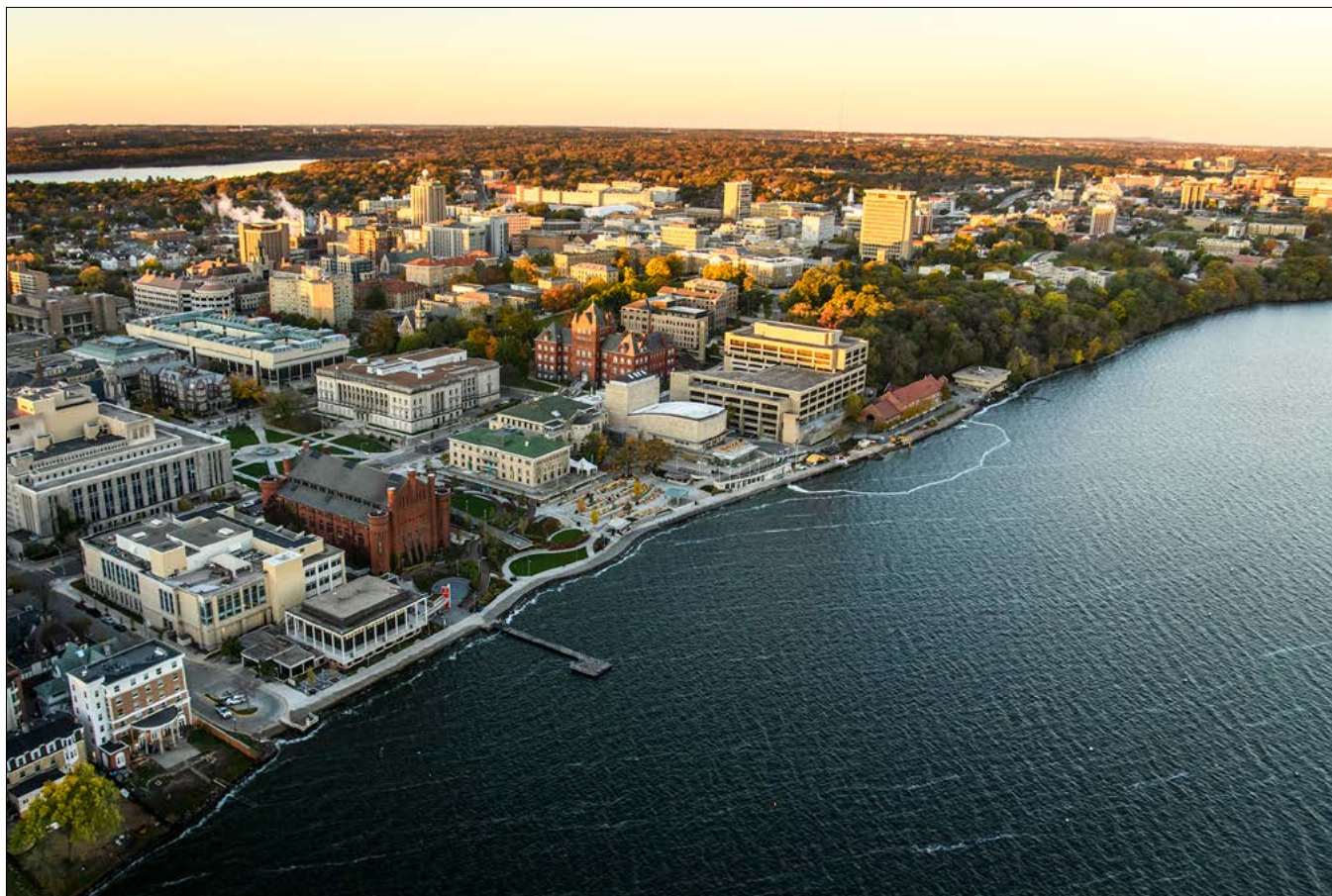
Lake Mendota and the University of Wisconsin–Madison campus are pictured in an aerial view taken from a helicopter