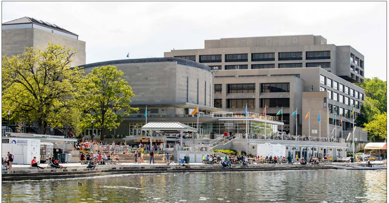
Memorial Union Terrace