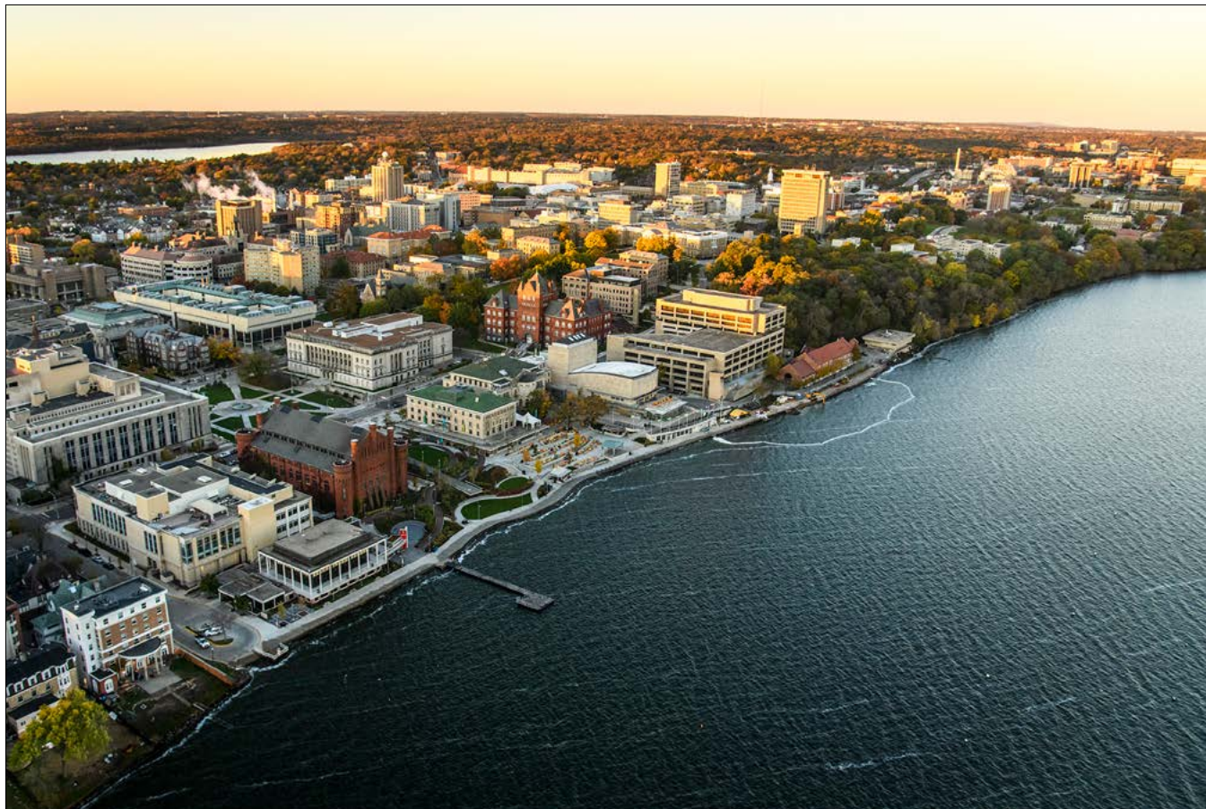
Lake Mendota and the University of Wisconsin–Madison campus are pictured in an aerial view taken from a helicopter