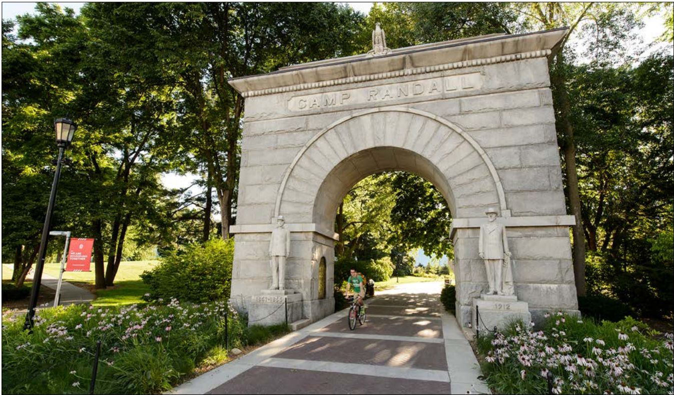
Camp Randall Memorial Arch