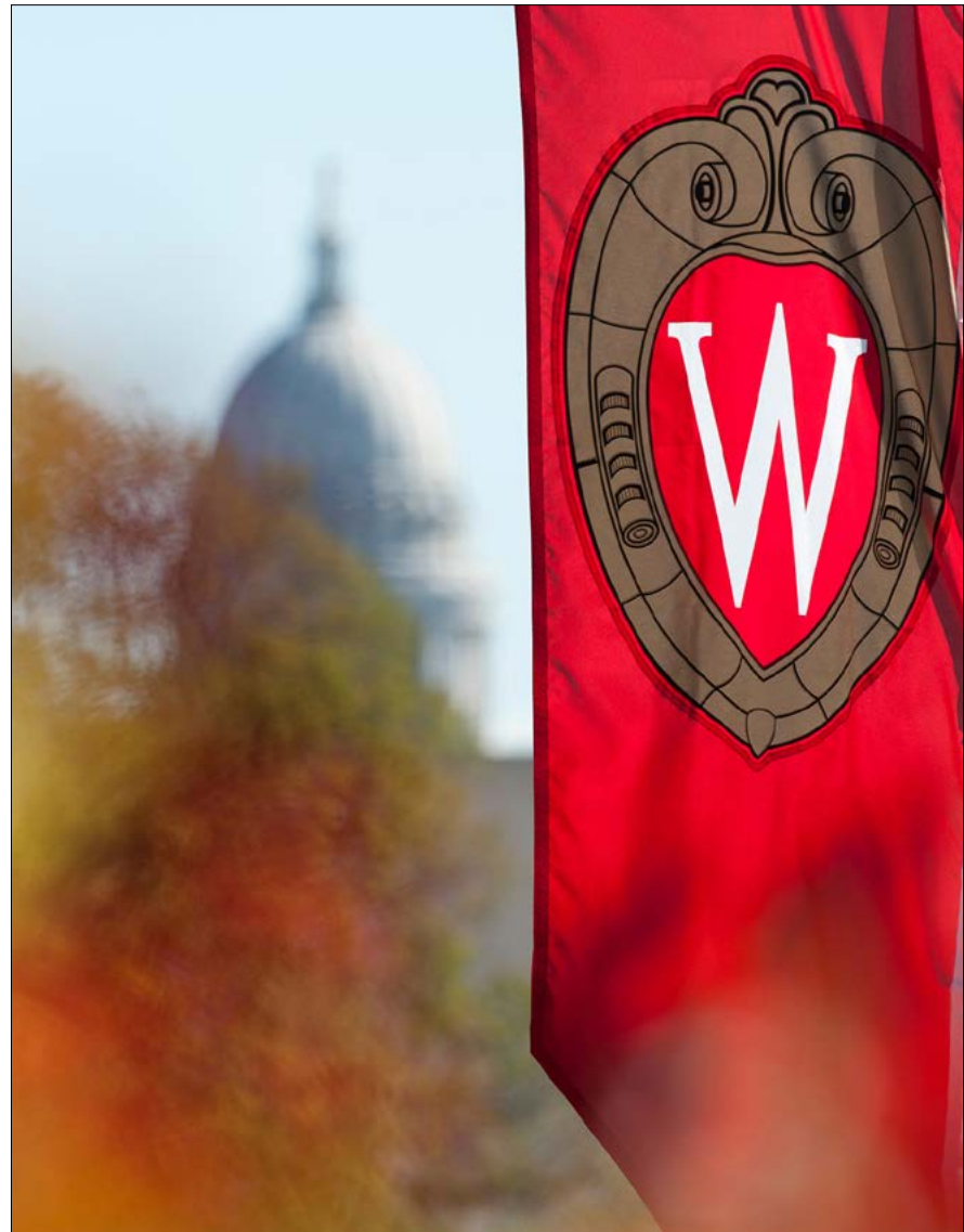
Banners on Bascom Hill