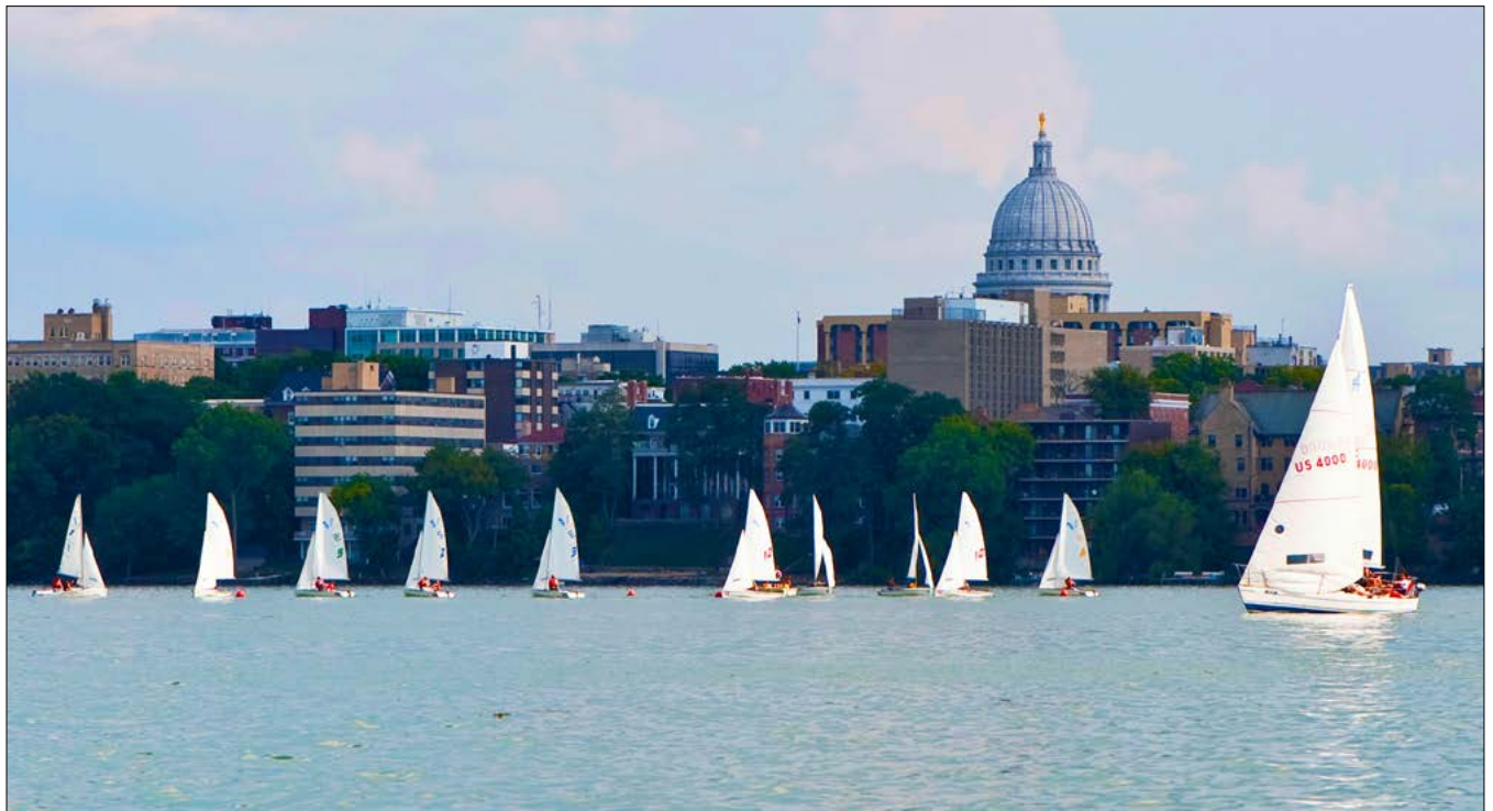
Sailing competition on Lake Mendota